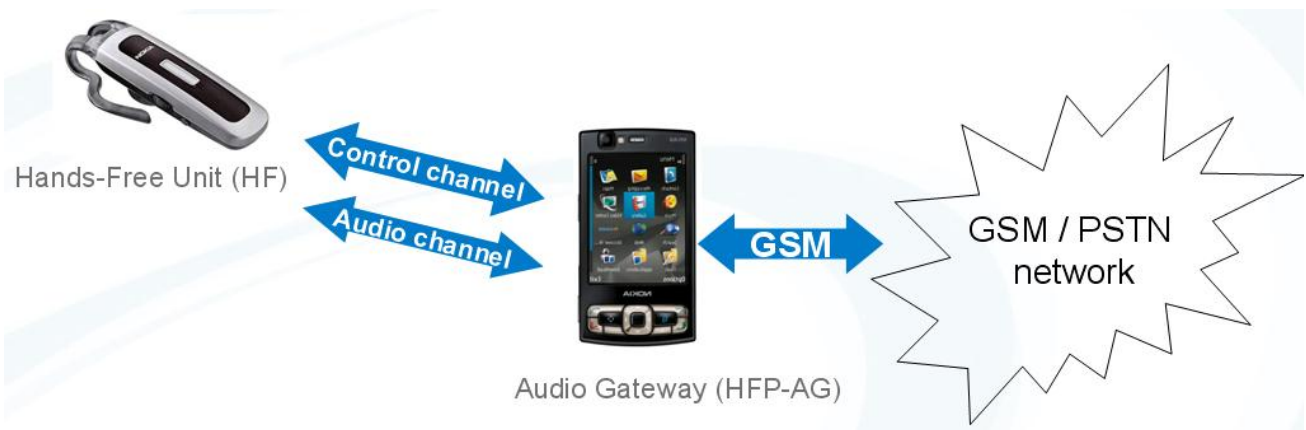
Figure 1: Typical HFP use case

Hands-Free profile v.1.5 and older support 8kHz, 8-bit audio and Hands-Free profile v.1.6 support 16kHz and 8-bit audio also known as Wide Band Speech or HD Voice.