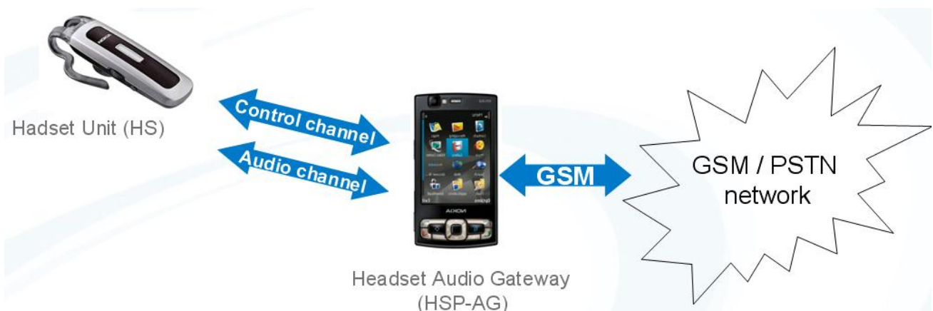
Figure 2: Typical HSP use case

Headset profile supports 8kHz, 8-bit audio.